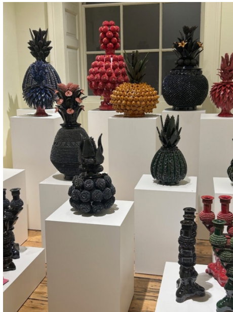
Objekti installation.