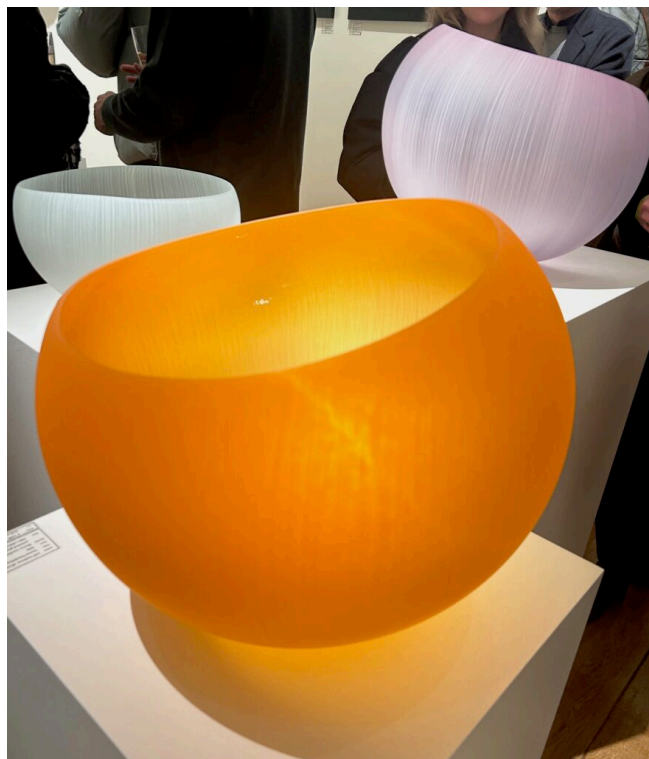
LEE Taehoon 'Sunset Dandelion Seeds'.

LEE Taehoon's luminous vessels created from blown, sandblasted and acid polished glass including 'Sunset Dandelion Seeds', caught the eye of the V&A who snapped it up for their collection.