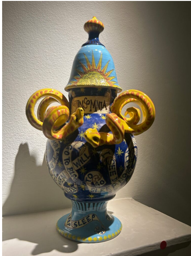
Katrin Moya 'Insomnia'.

in women's lives through the ages, but one that has been under-represented in our culture until recently.