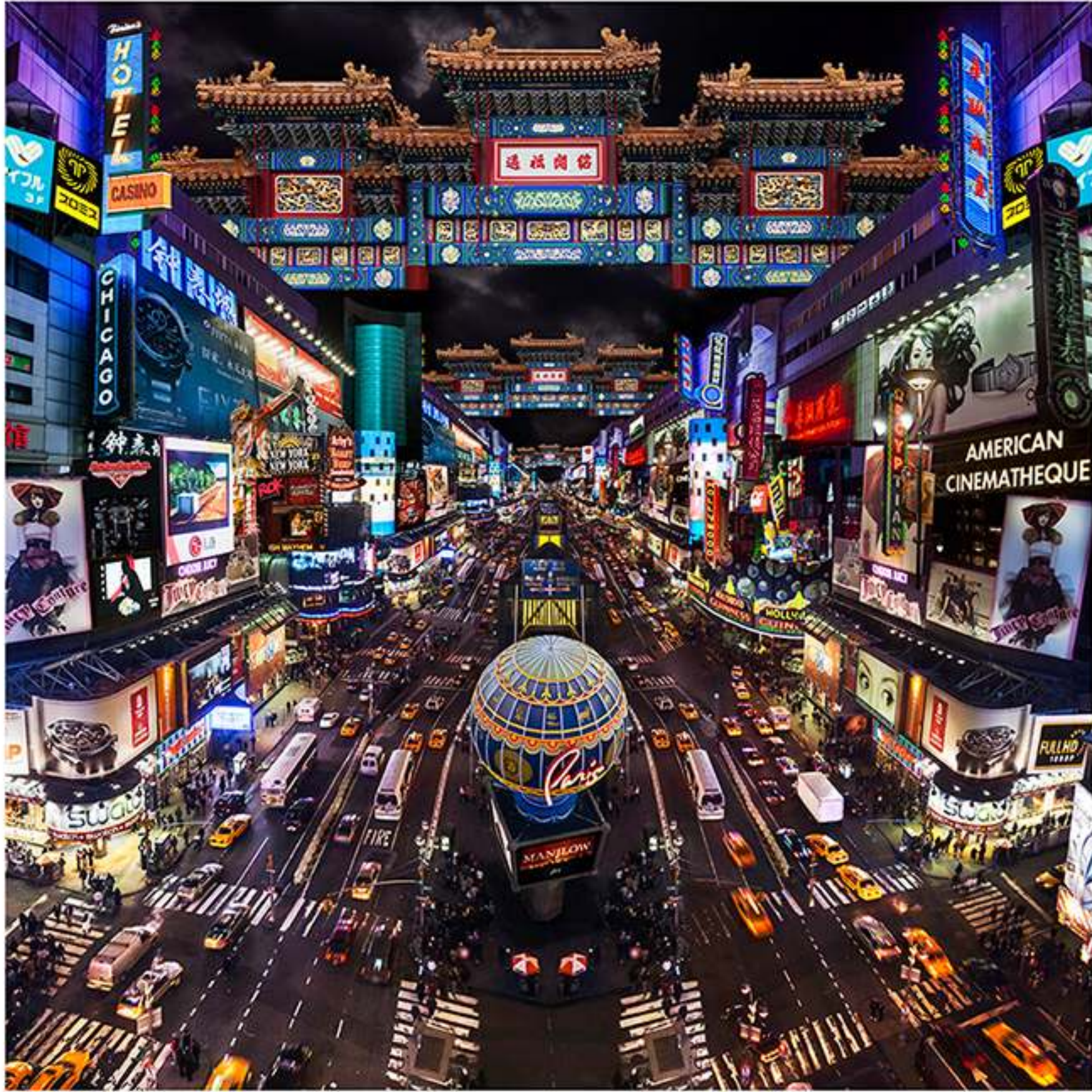
TOM LEIGHTON 7th Avenue, 2013 Edition of 5 C- Type Digital Print, Perspex mounted 60 x 60 in.