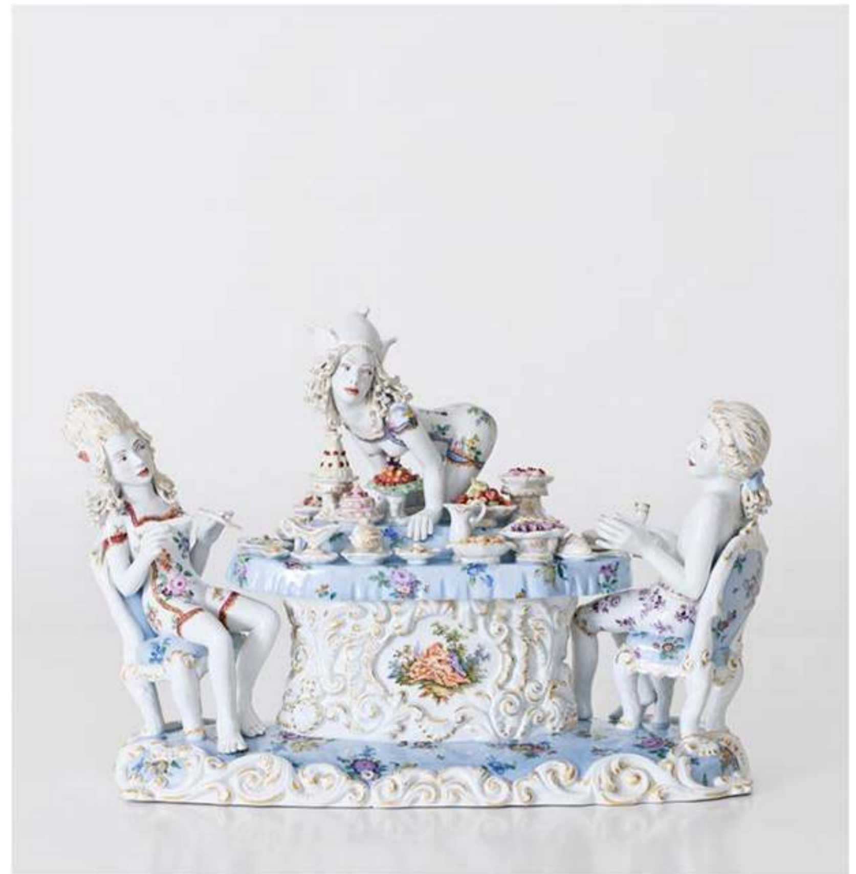
Chris Antemann, "Covet", 2013, Edition of 8, Meissen Porcelain, 13.4 x 18.9 x 71 in. Courtesy MEISSEN © Art Collection