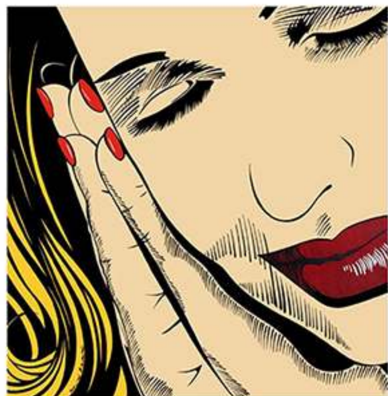
DEBORAH AZZOPARDI I Say a Little Prayer for You 2014, Acrylic on board 20 x 20 in.