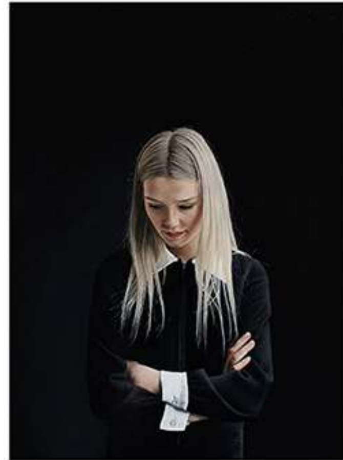
CHARLIE MOXON Highly Commended 2012 Sarah in a Black Dress, 2014 Oil on Canvas 15.7 x 11.8 in