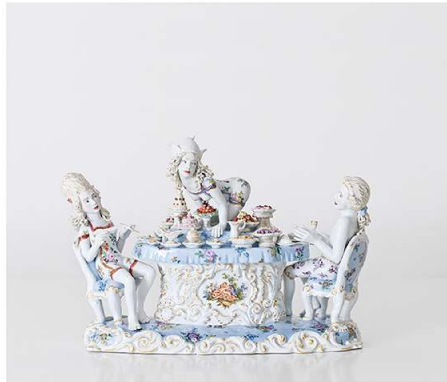
Covet, 2013 Edition of 8 Meissen Porcelain 13.4 x 18.9 x 7.1 in ANTEMANN DREAMS Collection