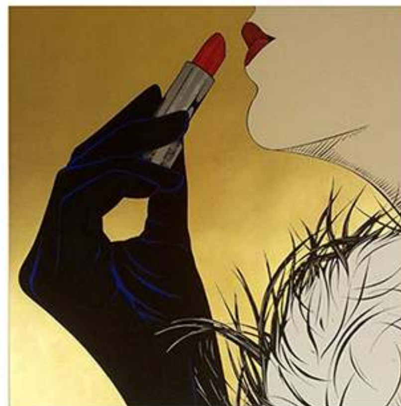
DEBORAH AZZOPARDI Pure Gold, 2012 Edition of 12 Real 24 carat gold leaf background 410gsm Somerset Tub 34 x 34 in.