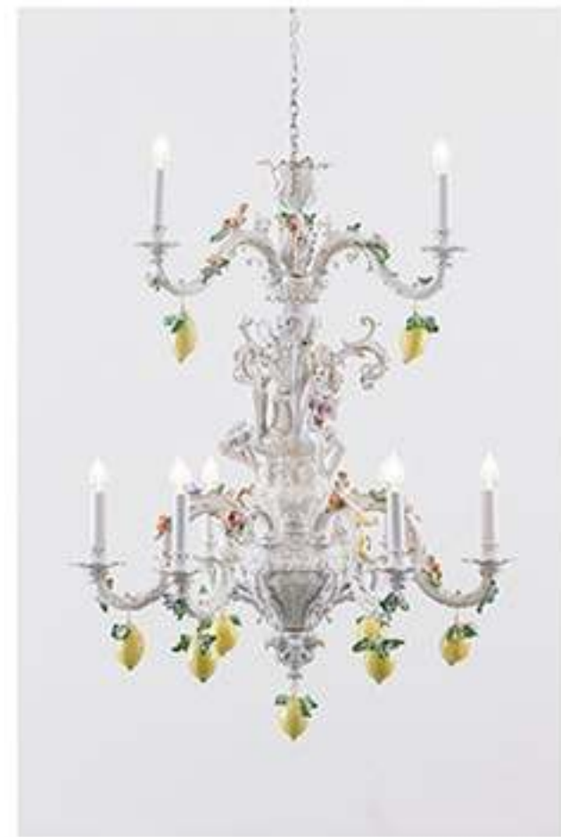
Lemon Chandelier, 2014 Edition of 10, Meissen Porcelain, 53.1 x 39.4 x 39.4 in. ANTEMANN DREAMS Collection, Courtesy MEISSEN COUTURE® Art Collection & Cynthia Corbett Gallery