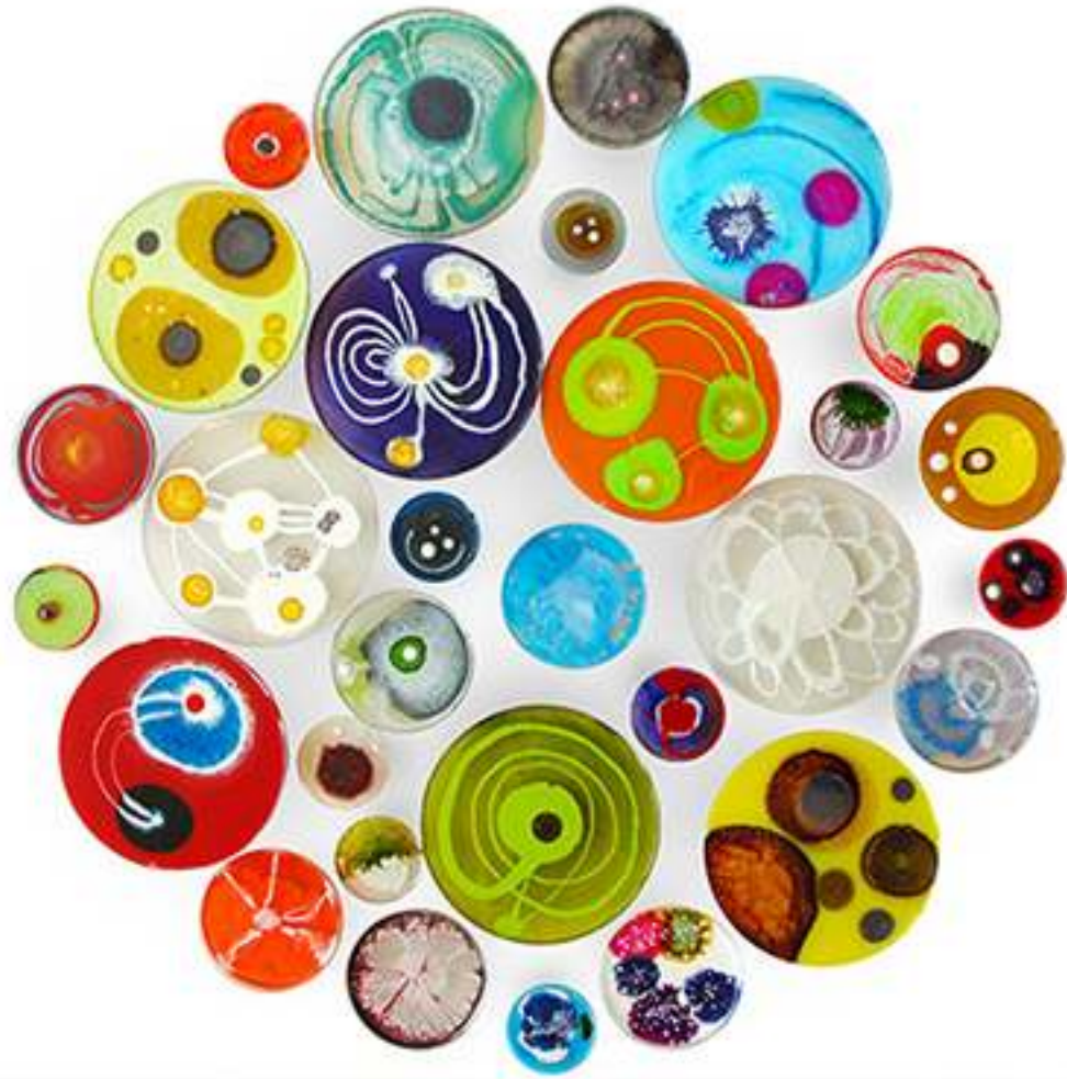
KLARI REIS Hypochondria 30, 2013 Mixed media, Petri Dishes, Tee Nuts and Steel Rods Circular Template 30in. diameter Illustration indicative of the work on display