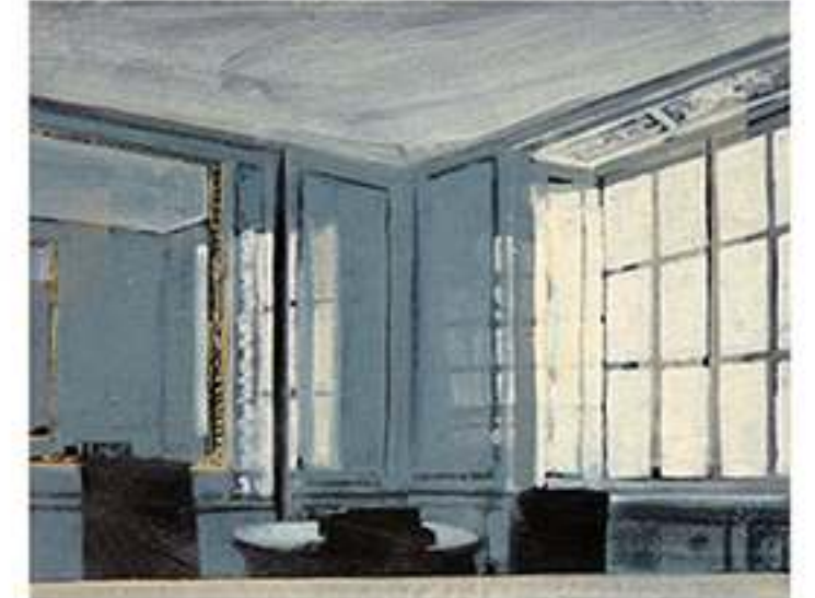
ELEANOR WATSON Highly Commended 2014 For Seven Days, 2014 oil on board 7.9 x 9.8 in.