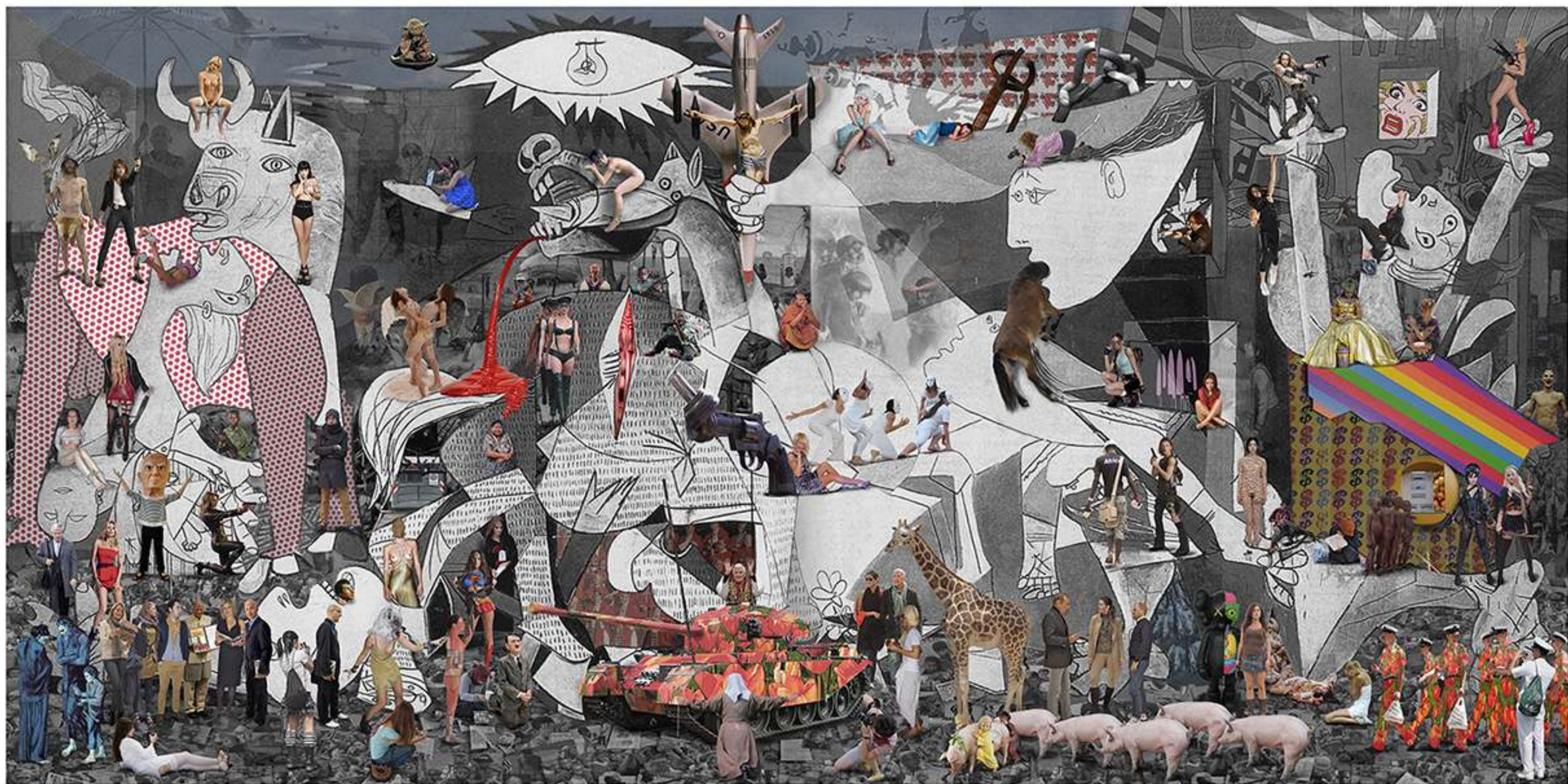
LLUIS BARBA Guernica, 2013 Edition of 6, C-type print, Perspex / Dibond mounted, 58.5 x 119.5 in.