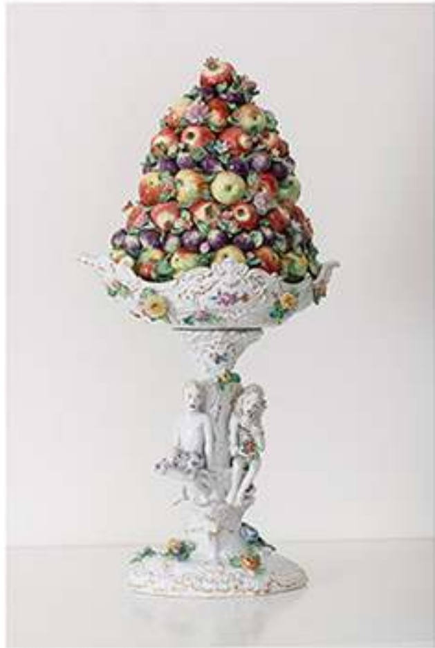
Fruit Pyramid I, 2014 Edition of 10, Meissen Porcelain, 41.3 x 20.9 x 14.2 in. ANTEMANN DREAMS Collection, Courtesy MEISSEN COUTURE® Art Collection & Cynthia Corbett Gallery