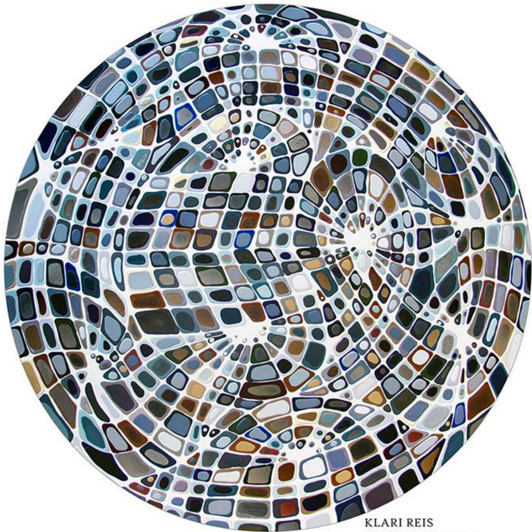
KLARI REIS Musings in Neutral, 2013 Mixed Media on Floating Aluminum Panel 60 in. diameter