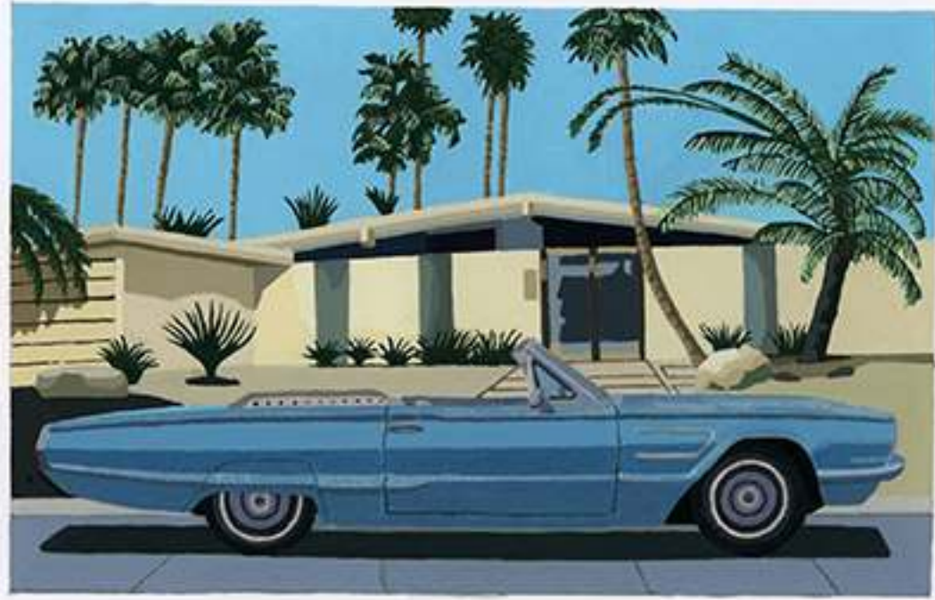
ANDY BURGESS Study, T-Bird Palm Springs II, 2014 Gouache on Paper 4 x 6 in