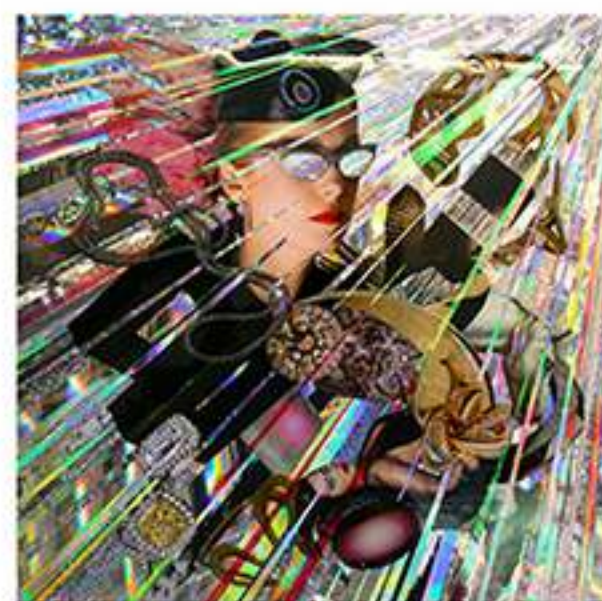
ANDRÉA STANISLAV Portia, from the Dispersion series, 2014, unique piece Epoxy resin, refractive film, holographic film, digital prints on board 24 x 24 x 3 in.