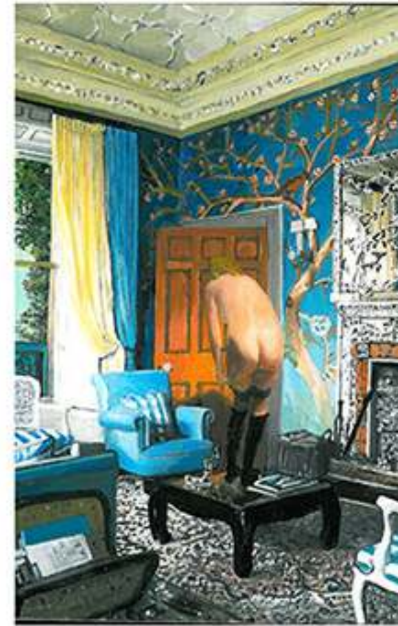
JUERGEN WOLF Winner 2014 Untitled, 2014 Mixed media on wood 9.3 x 6.1 in.