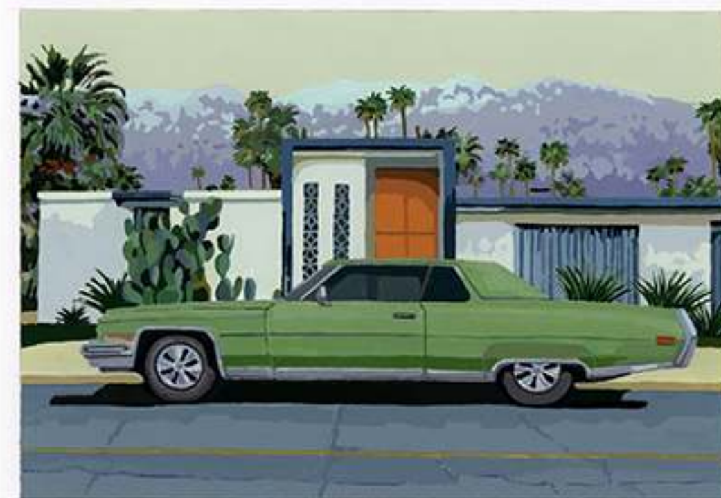
ANDY BURGESS Study for 1972 Cadillac, Palm Springs, 2014 Gouache on Paper 4 x 6 in