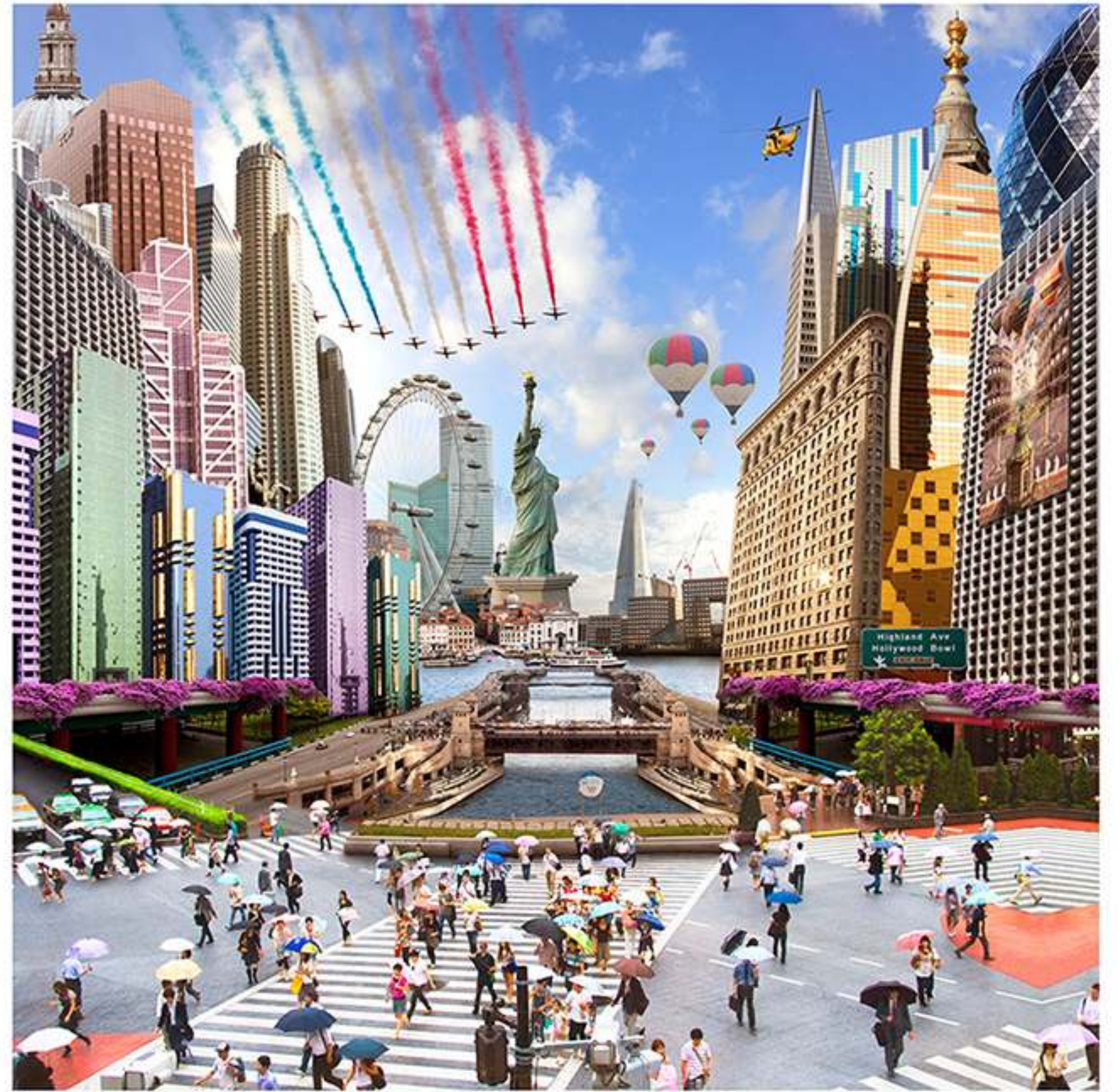
TOM LEIGHTON Chicago River, 2012 Edition of 5 C- Type Digital Print, Perspex mounted 60 x 60 in.