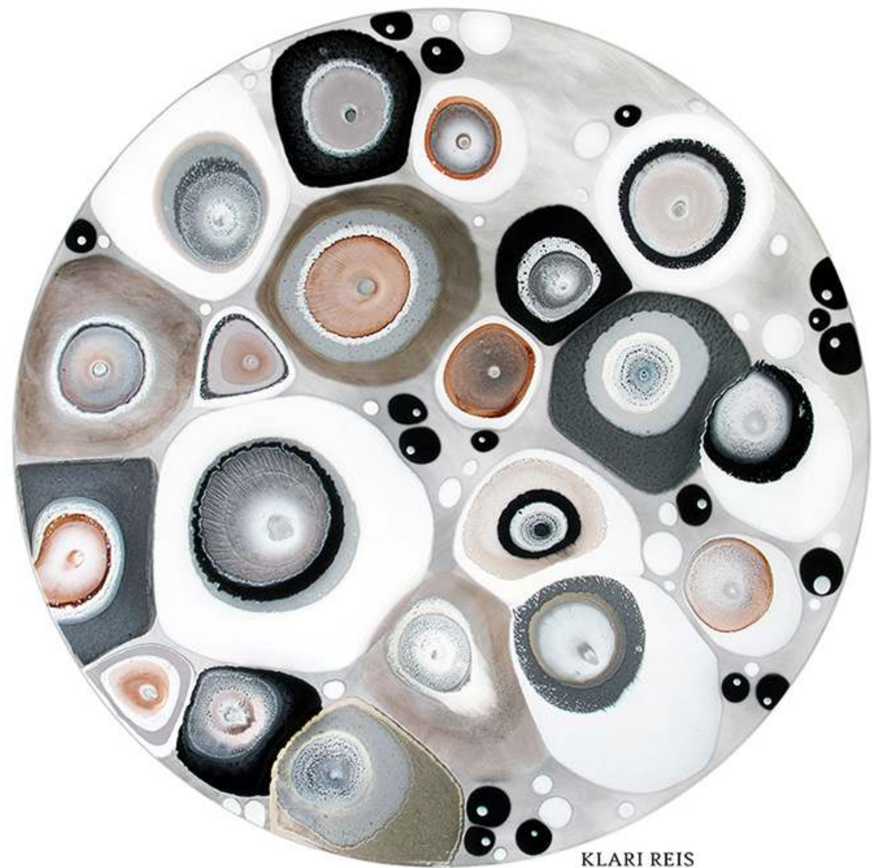
KLARI REIS Colossal Silver Petri, 2013 Mixed Media on Floating Aluminum Panel 60 in. diameter