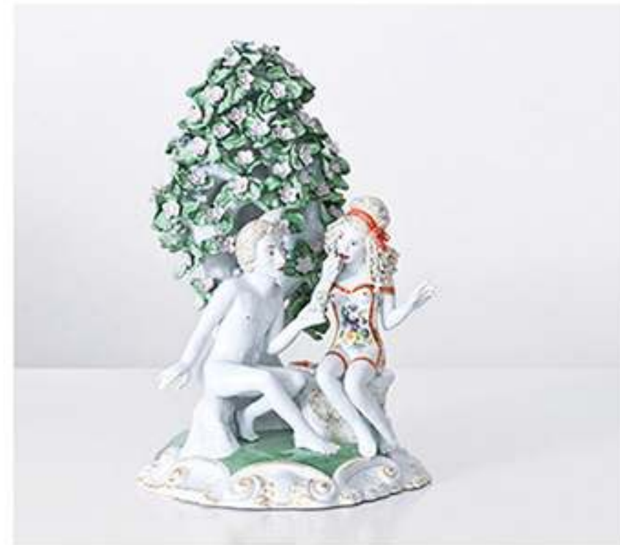
Pursuit of Love, 2013 Edition of 8 Meissen Porcelain H 15.7 x 18.9 x 7.1 in ANTEMANN DREAMS Collection, Courtesy MEISSEN COUTURE® Art Collection & Cynthia Corbett Gallery