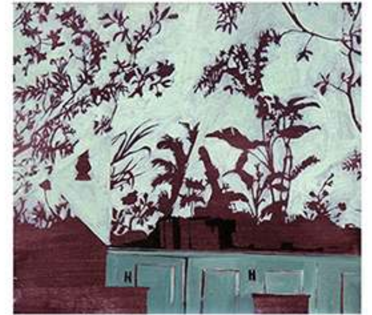
ELEANOR WATSON Highly Commended 2014 Telltale, 2014 oil on board 8.7 x 9.8 in.