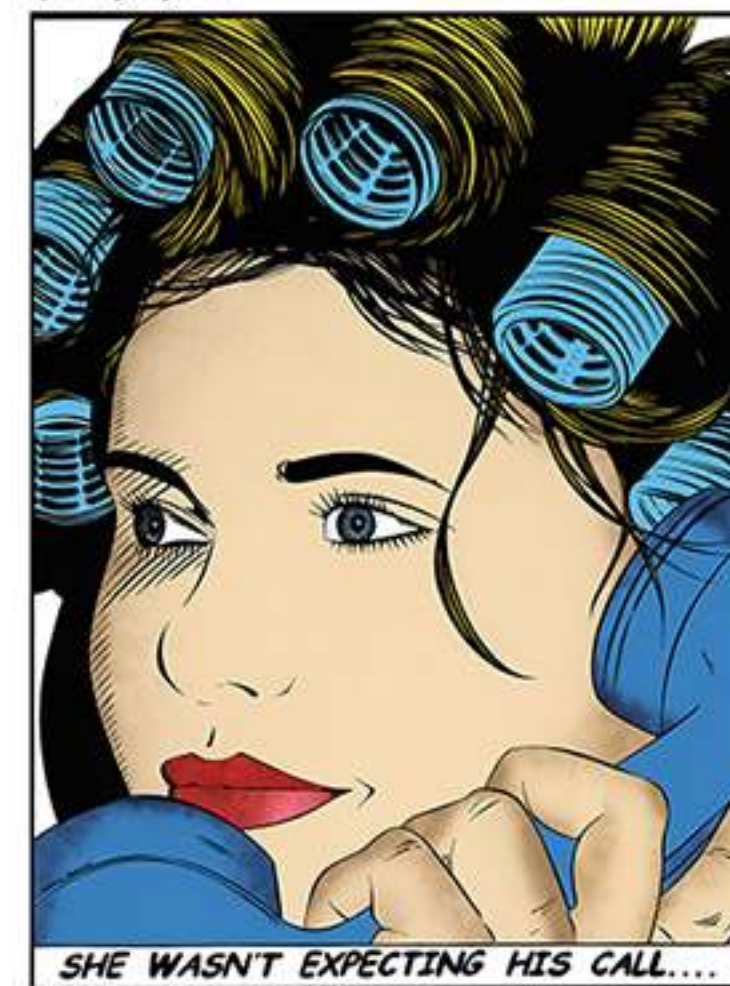
DEBORAH AZZOPARDI The Unexpected Call, 2012 Acrylic on board 48 x 36.5 in.