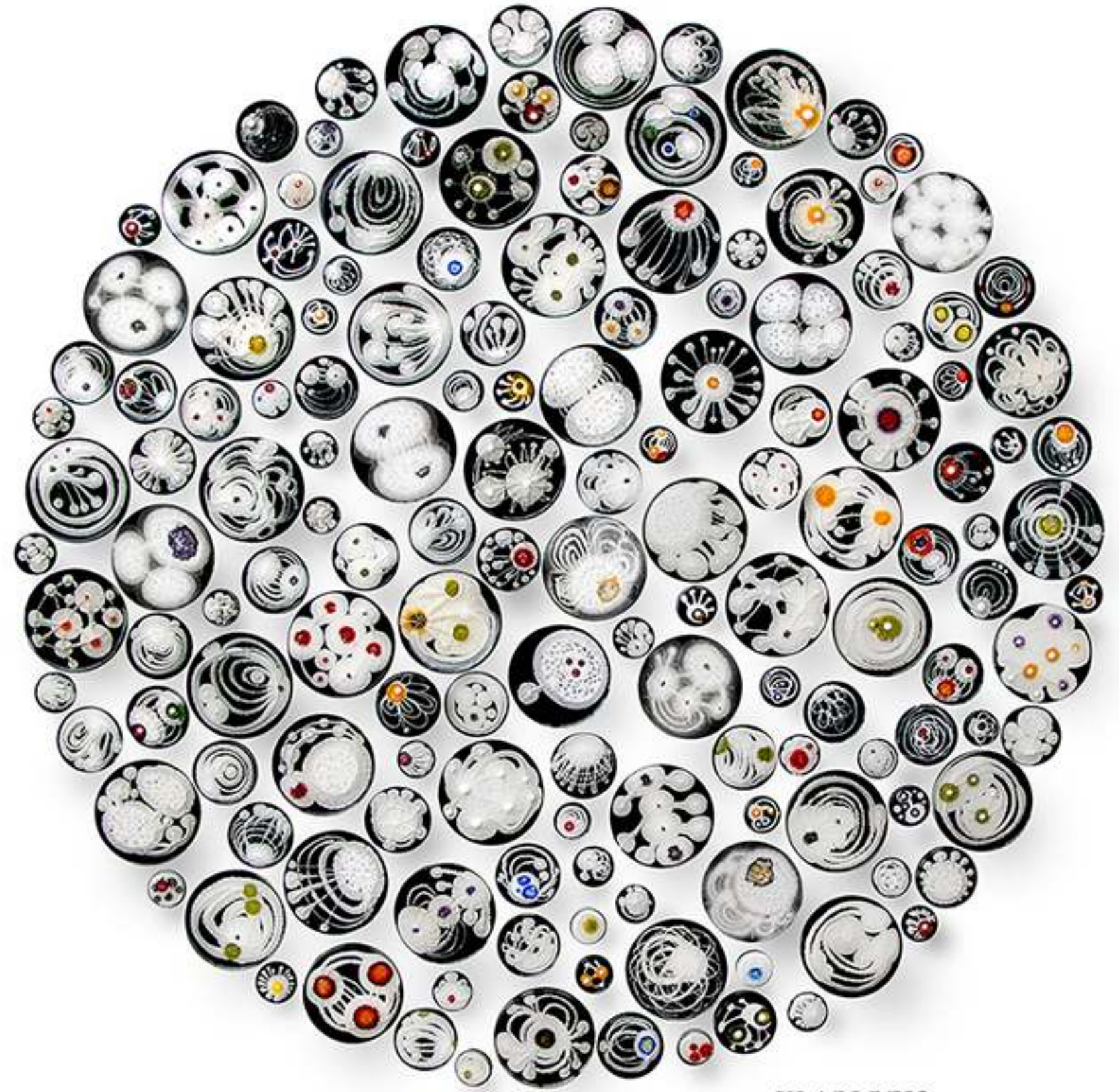
KLARI REIS Hypochondria 150 Noir, 2013 Mixed media, Petri Dishes, Tee Nuts and Steel Rods Circular Template 60in. diameter