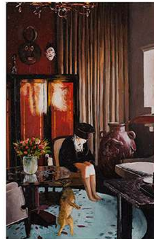
JUERGEN WOLF Winner 2014 Untitled, 2013 Mixed media on wood 9.3 x 6.1 in.