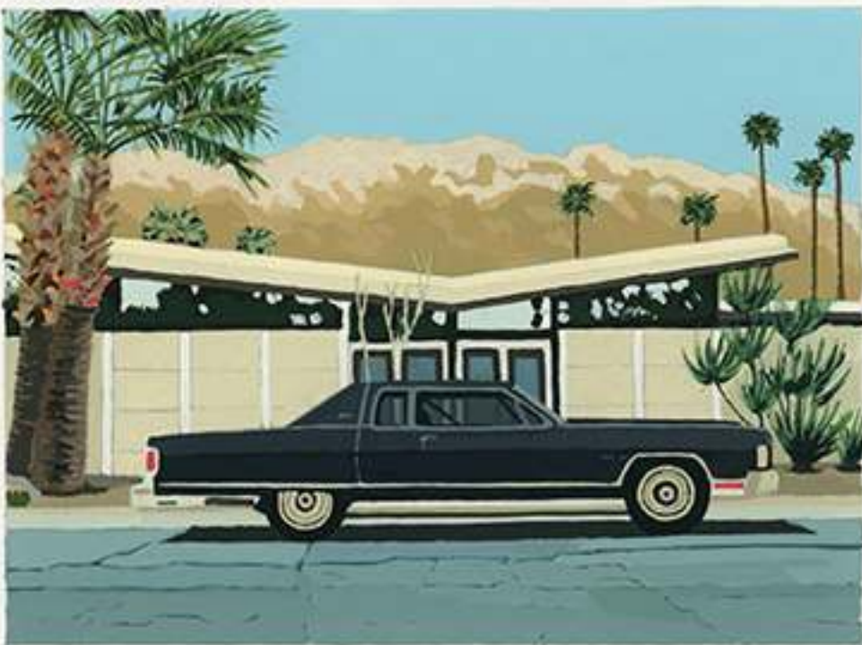
ANDY BURGESS Study for Lincoln Continental in Park Springs, 2014 Gouache on Paper 4 x 6 in