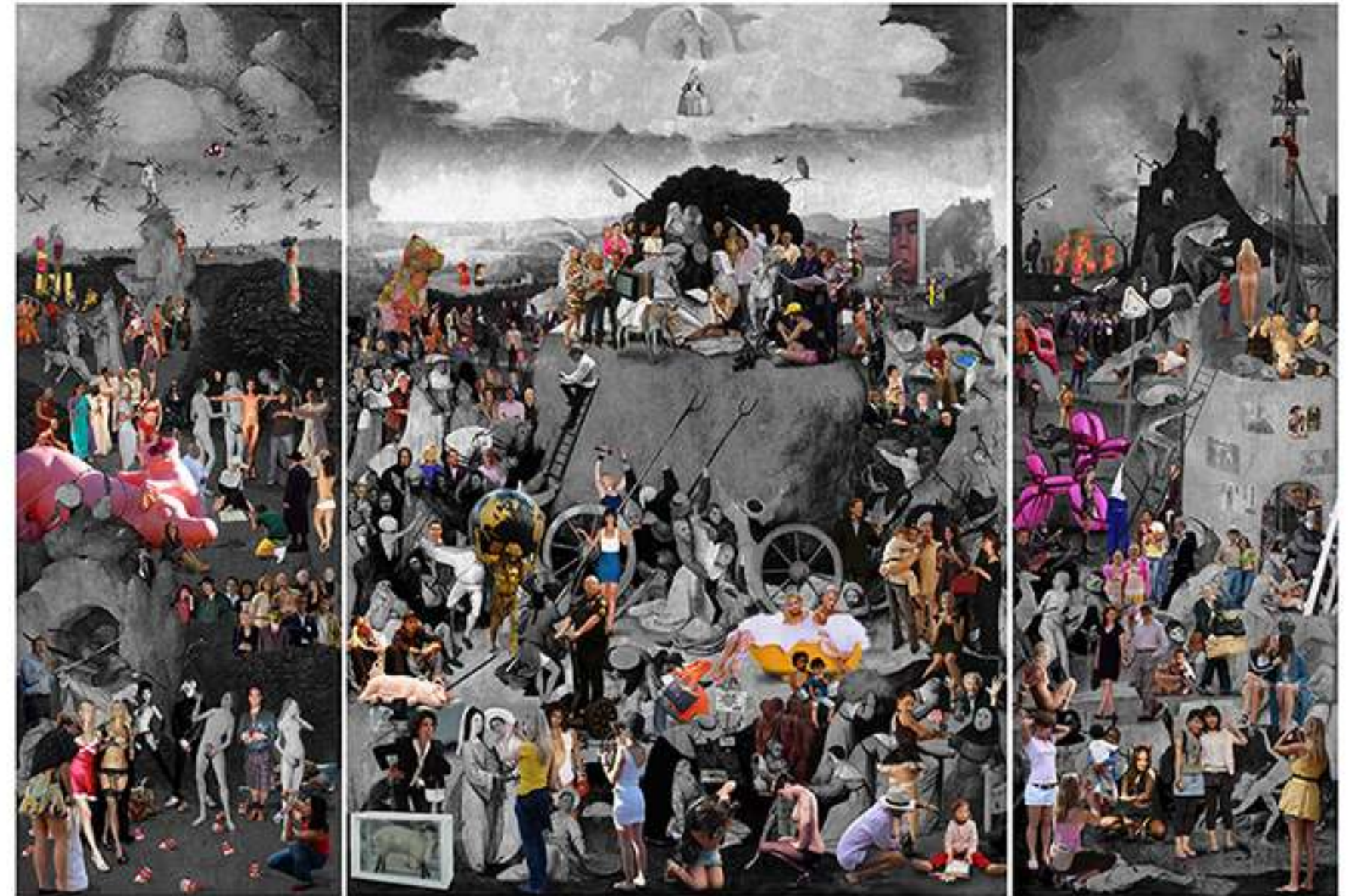
LLUIS BARBA The Hay Wain, Bosco, 2010 Edition of 6 C-type print, Perspex/Aluminium mounted 59 x 89 in.