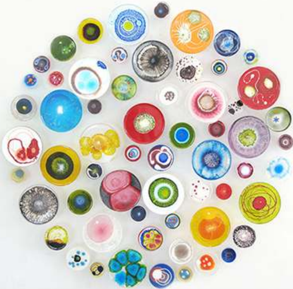
KLARI REIS Hypochondria 60, 2013 Mixed media, Petri Dishes, Tee Nuts and Steel Rods Circular Template 60in. diameter Illustration indicative of the work on display