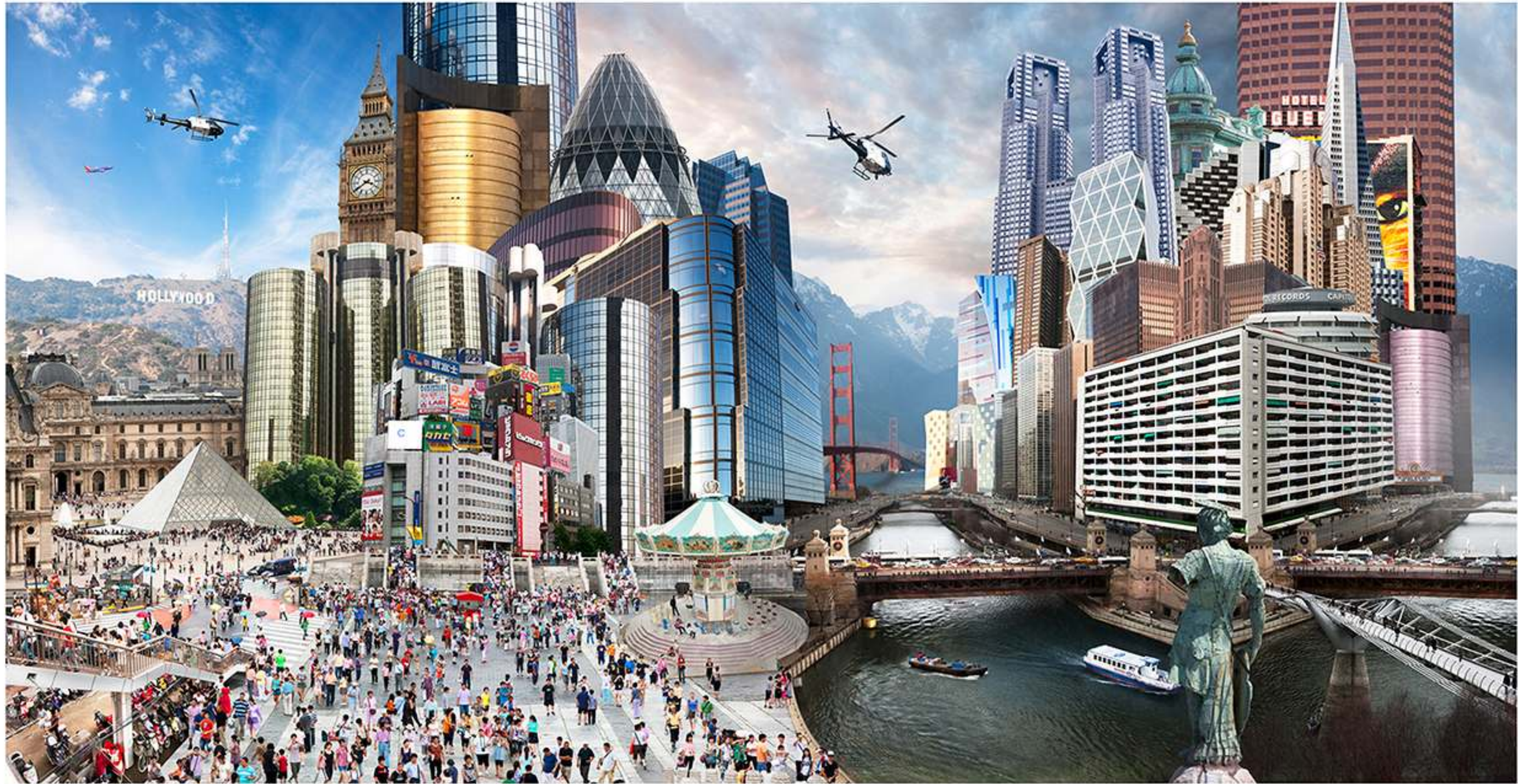
TOM LEIGHTON Hollywood Land, 2012 AP2 - Final Work C- Type Digital Print Perspex mounted 60 x 116 in.