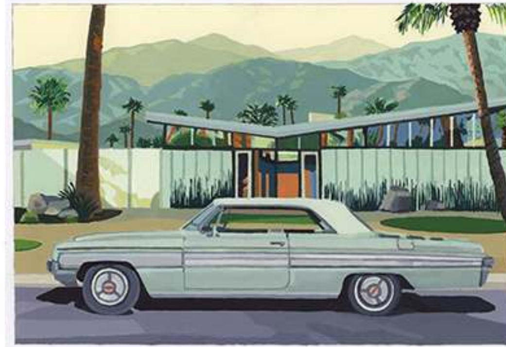
ANDY BURGESS Study for Oldsmobile Starlife, Palm Springs, 2014 Gouache on Paper 4 x 6 in