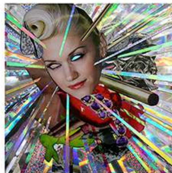
ANDRÉA STANISLAV Tatiana, from the Dispersion series, 2014, unique piece Epoxy resin, refractive film, holographic film, digital prints on board 10 x 10 x 3 in.