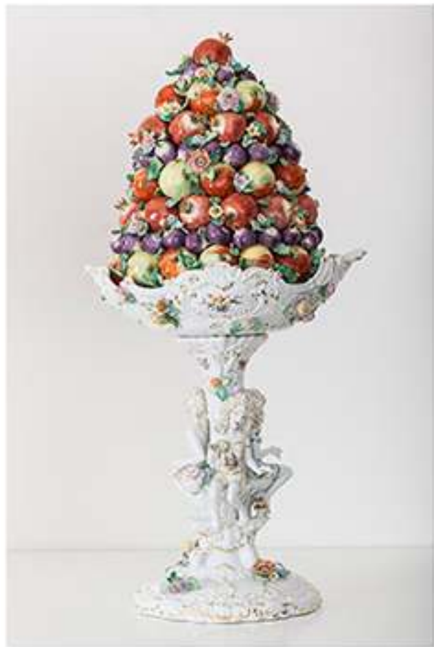
Fruit Pyramid II, 2014 Edition of 10, Meissen Porcelain, 41.3 x 20.9 x 14.2 in. ANTEMANN DREAMS Collection, Courtesy MEISSEN COUTURE® Art Collection & Cynthia Corbett Gallery