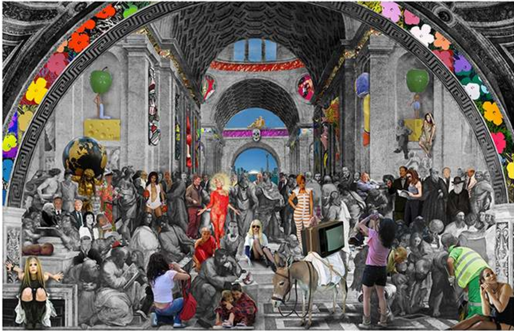
LLUIS BARBA The School of Athens, Raphael, 2011 Edition of 6 C-type print, Perspex mounted 63 x 98.4 in.