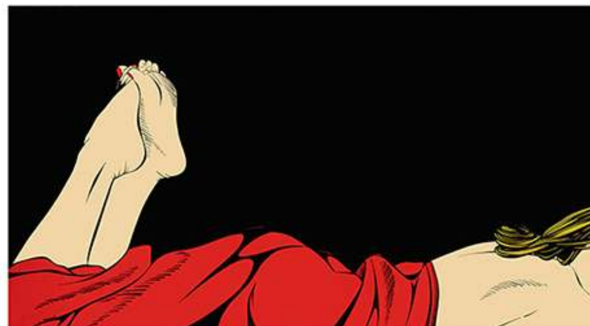
DEBORAH AZZOPARDI Relaxing, 2007 Acrylic on Board 26 x 48 in.