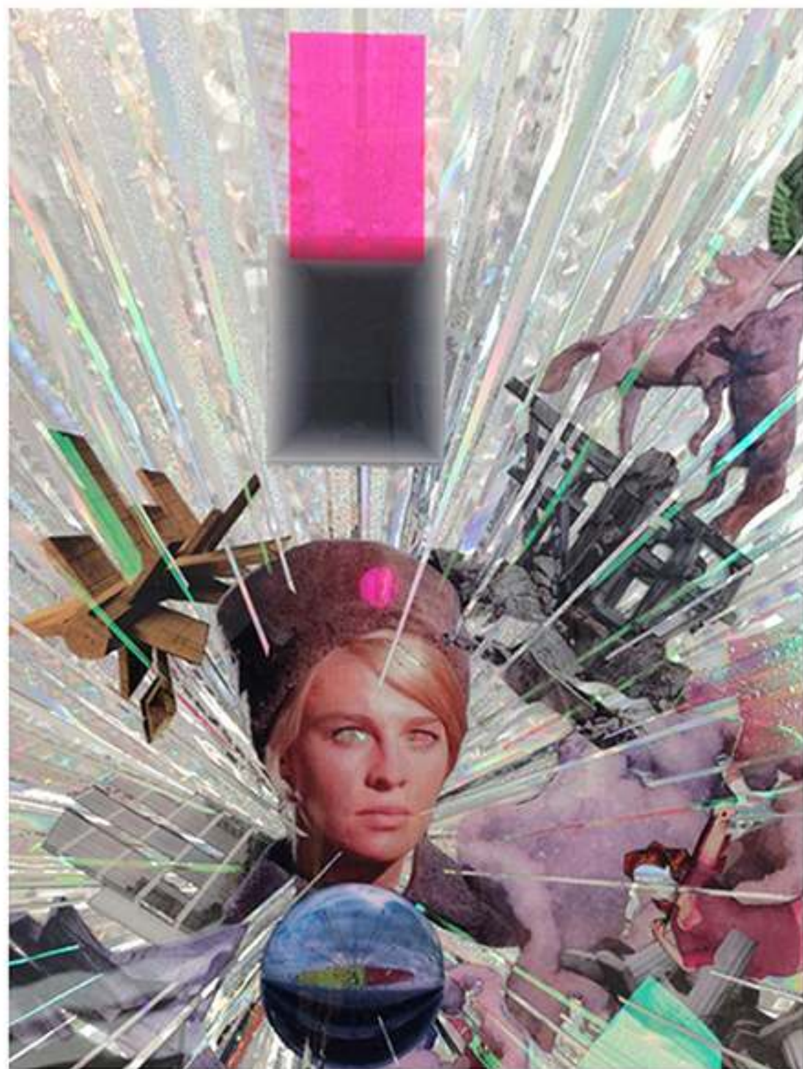
ANDRÉA STANISLAV Shifter I (detail), 2014 Unique work Epoxy resin, refractive film, holographic film, digital prints 48 x 48 in.