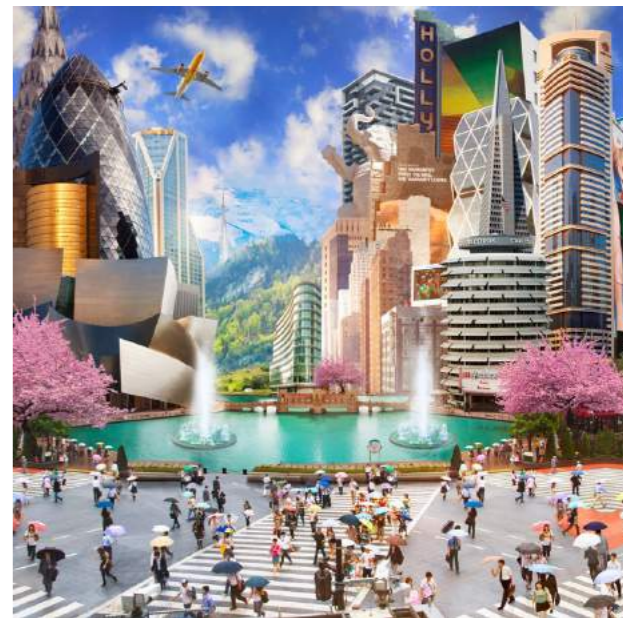
Tom Leighton The Capitol , 2016 Edition of 5 C-print perspex mounted on aluminium 48 x 48 in