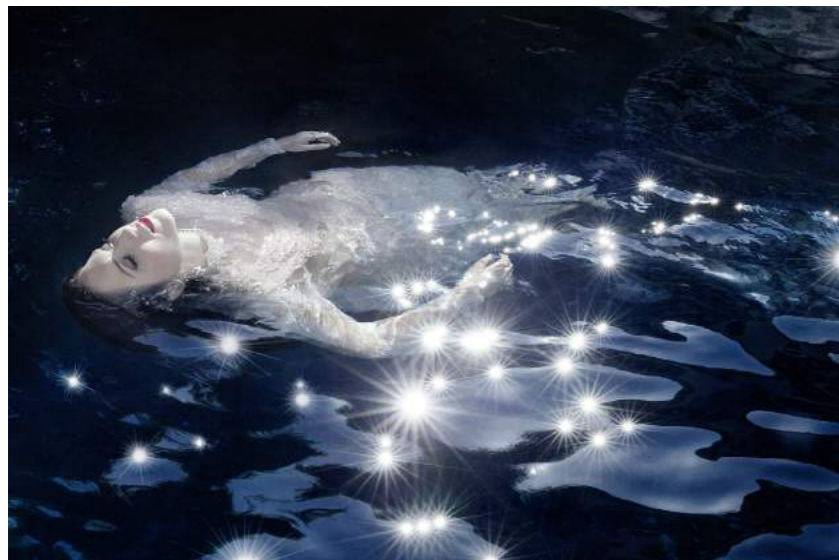
Elisabeth Caren Ophelia No.5 , 2013 Edition of 6 C-print, perspex mounted on aluminium 40 x 60 in.