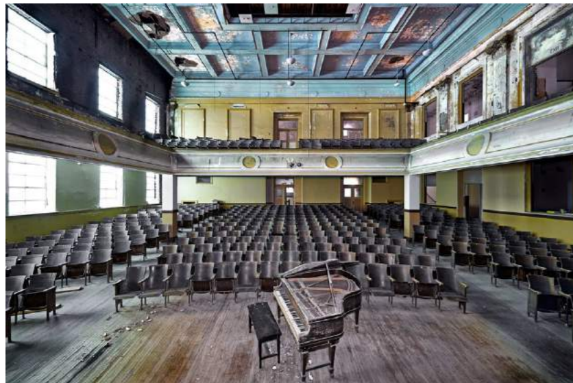
Fabiano Parisi The Empires of Light Series, No. 03 - USA, 2014 Edition of 8 C-type photograph mounted on dibond in tray frame 29.5 x 43.3 in.