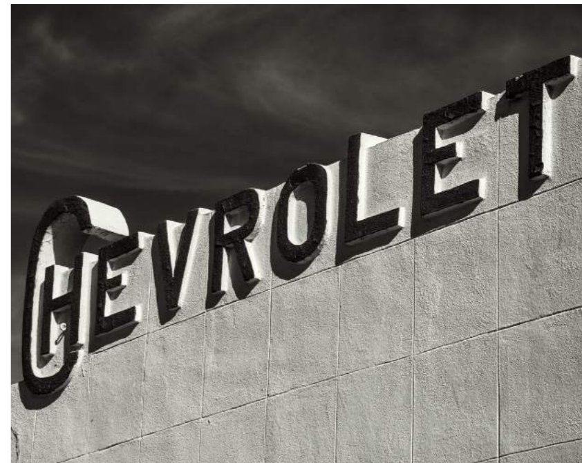
Andy Burgess Chevrolet , 2015 Edition of 10 Sepia Toned Silver gelatin on fibre paper 8 x 10 in