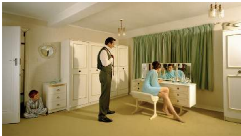
Lottie Davies The Blue Bedroom , 2005 Edition of 10 Lambda print on aluminium in tray frame 22 x 39.4 in