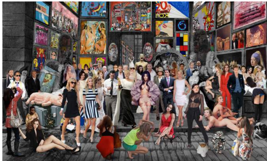
Lluís Barba La Muestra de Gersaint Watteau , 2016 Edition of 6 C-print, perspex mounted on aluminium 39 x 65 in