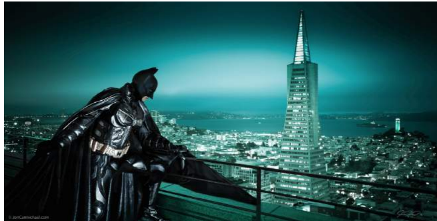
Jon Carmichael Anonymous , 2014 Edition of 18 C-type print/perspex mounted in stainless frame with a black linen liner 30 x 60 in