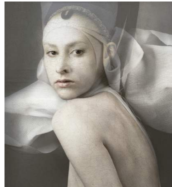
Isabelle Van Zeijl She, 2014 Edition of 7 Perspex face mounted C-print on dibond in tray frame 43.3 x 39.4 in.