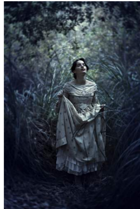
Right: Elisabeth Caren Cage Crinoline , 2013 Edition of 6 C-print, deckled and floating on in a white wood frame 29 3/8 x 22 1/2 in