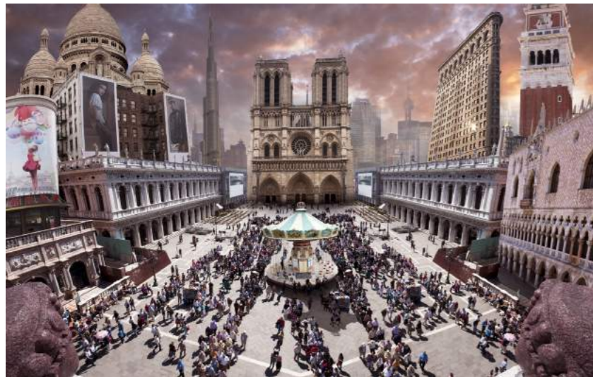
Tom Leighton Venice 2 , 2010 Edition of 5 C-print, perspex mounted on aluminium 48.8 x 78.8 in