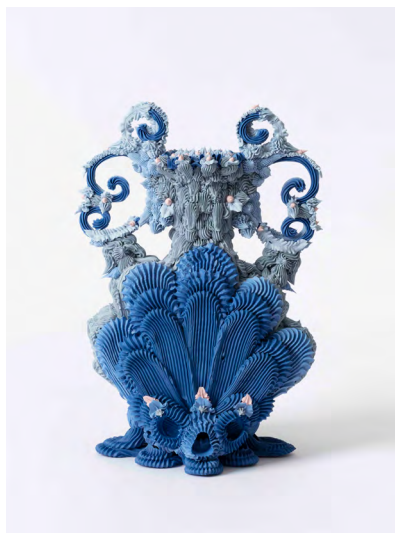
Ebony Russell, Siren Shell Urn , 2023 Porcelain and stain 35 x 23 x 20 cm, 13 3/4 x 9 x 7 3/4 in.

67 YORK STREET GALLERY, LONDON, 14 - 20 OCTOBER 2025