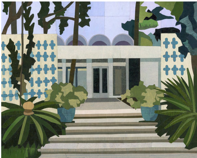
Andy Burgess, Spanish Mid-century , 2023, Painted Paper Collage, 39.37 x 38.1 cm, 15.5 x 15 in.

Decorated: The Sculptural Ceramics of Ebony Russell | 19 May - 26 Sept 2025