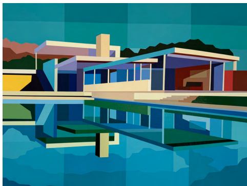
Andy Burgess, Kaufmann House VIII , 2025 Acrylic on canvas 76.2 x 101.6 cm, 30x40 in.

67 YORK STREET GALLERY, LONDON, 23 JUNE - 2 JULY 2025