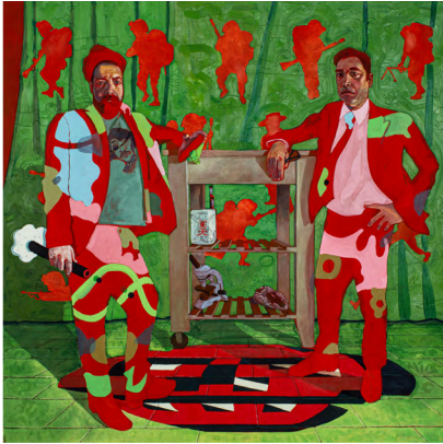
Thomas Macgregor - The Best Men , 2022, Oil on Canvas.

THE EXHIBITIONIST HOTEL, SOUTH KENSINGTON, LONDON, 16 JANUARY - 8 APRIL 2025