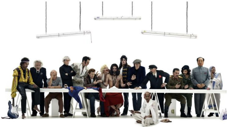
G rard Rancinan – Le Banquet des Idoles (I), 2012 180 x 300cm Argentic print mounted on plexiglas in artist’s frame