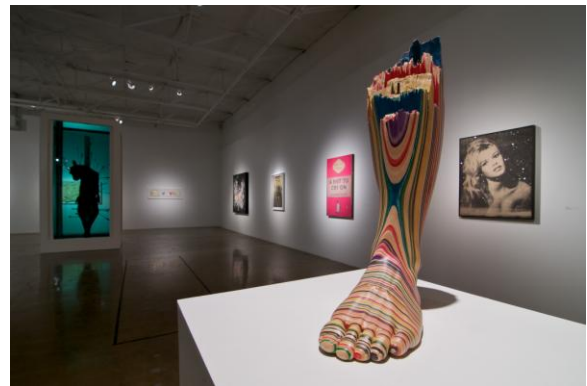
MTV RE:DEFINE Exhibition View, 2011