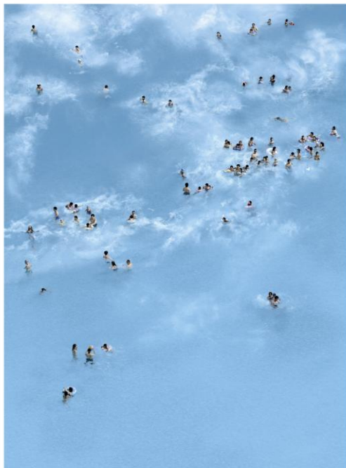
Ralf Kaspers – Summerland III Tokyo, 2011 267 x 200cm Lambda print on Diasec mount