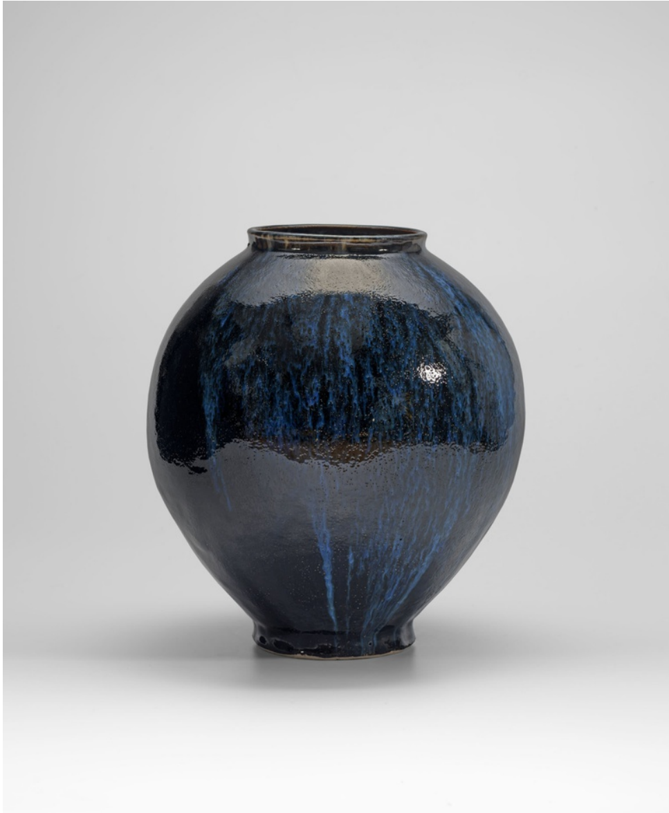
Black Amber Glaze made with French Ochre and a Hint of Cobalt Overlayed with a Willow Jun Glaze. 32 x 26 cm 12 5/8 x 10 1/4 in. (MFr001)