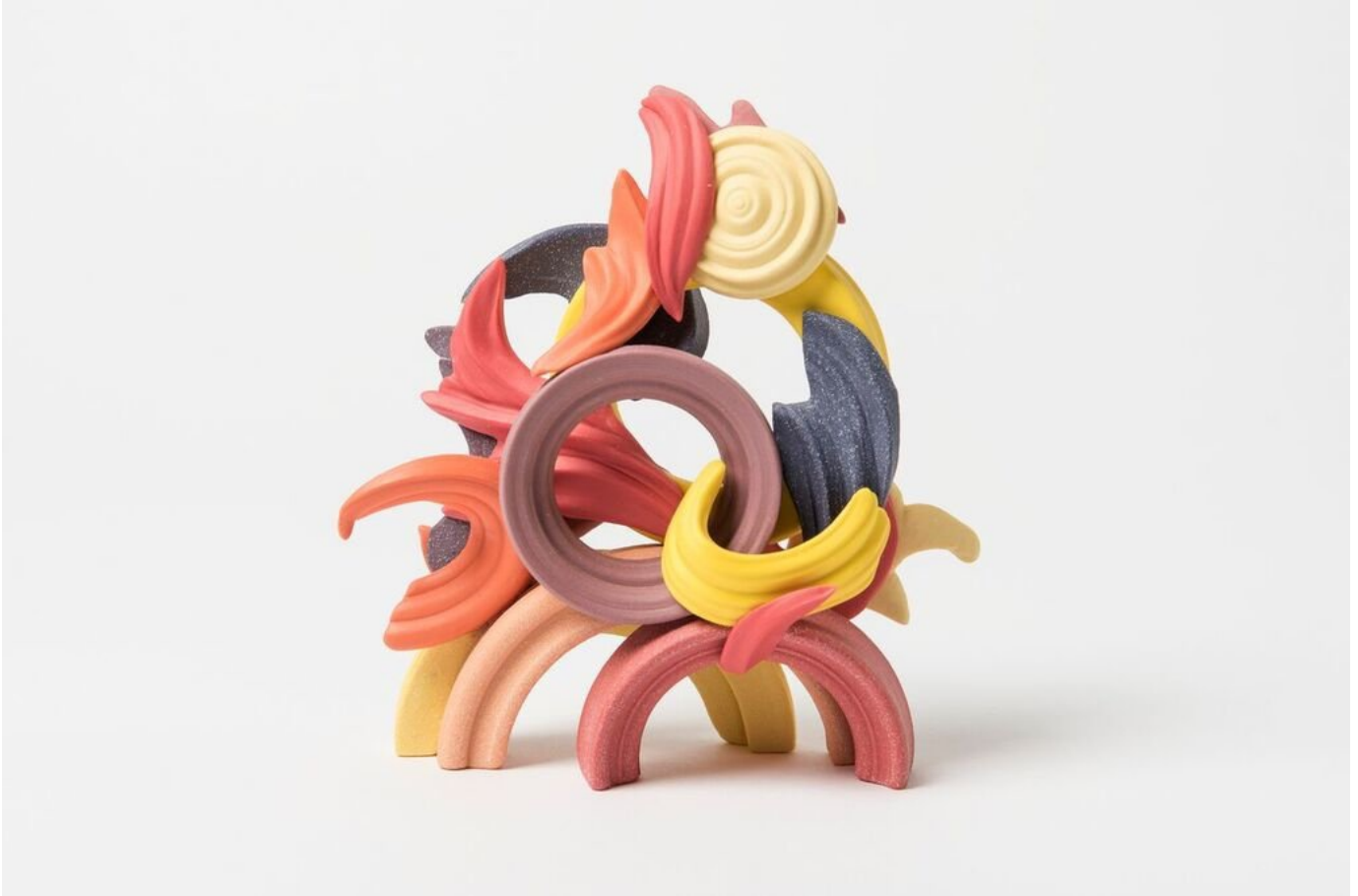
Grogged Porcelain 16 x 15 x 6 cm 6 1/4 x 5 7/8 x 2 3/8 in. (JT056)