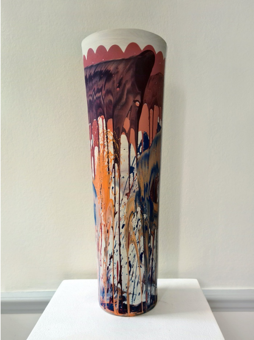
Porcelain 51 x 16 cm 20 1/8 x 6 1/4 in. (JPg001)