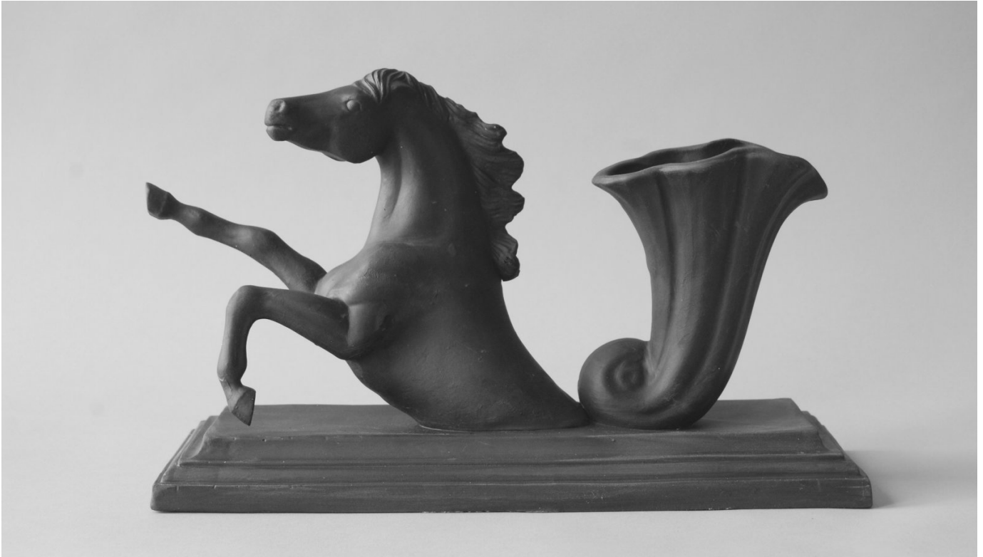
Black Parian 18 x 30 x 13 cm 7 1/8 x 11 3/4 x 5 1/8 in. (MS083)