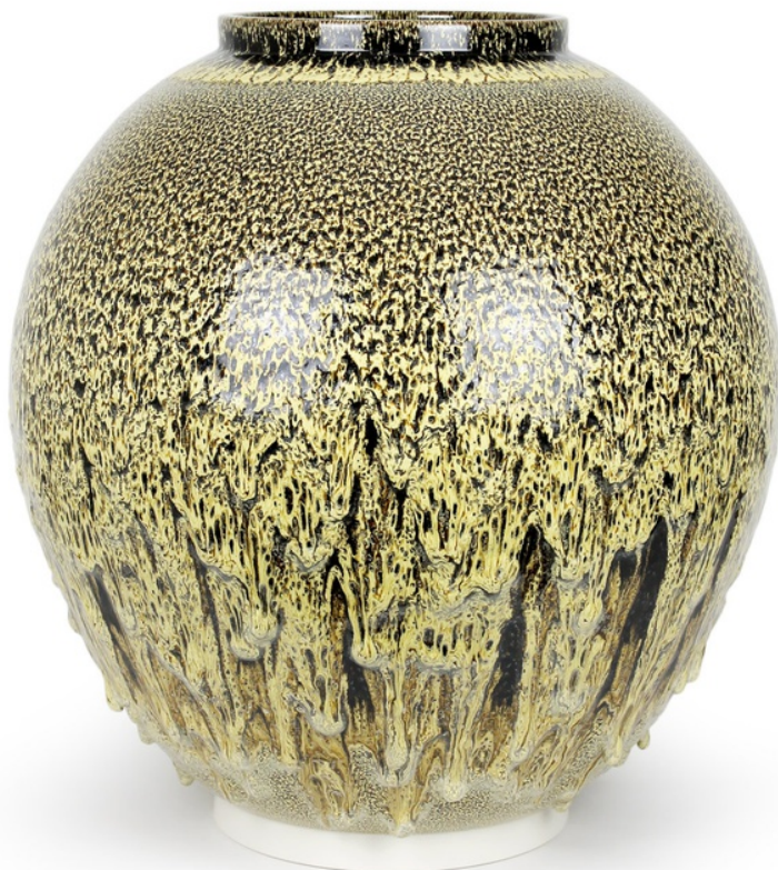
Oil Spot – Glazed Thrown Porcelain 57 x 54 x 54 cm 22 1/2 x 21 1/4 x 21 1/4 in. (AMo019)