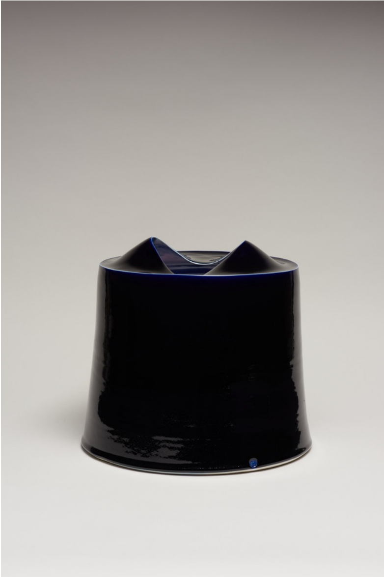
Limoges porcelain, thrown on the wheel, fired 1280° 33 x 30 cm 13 x 11 3/4 in. (TG002)