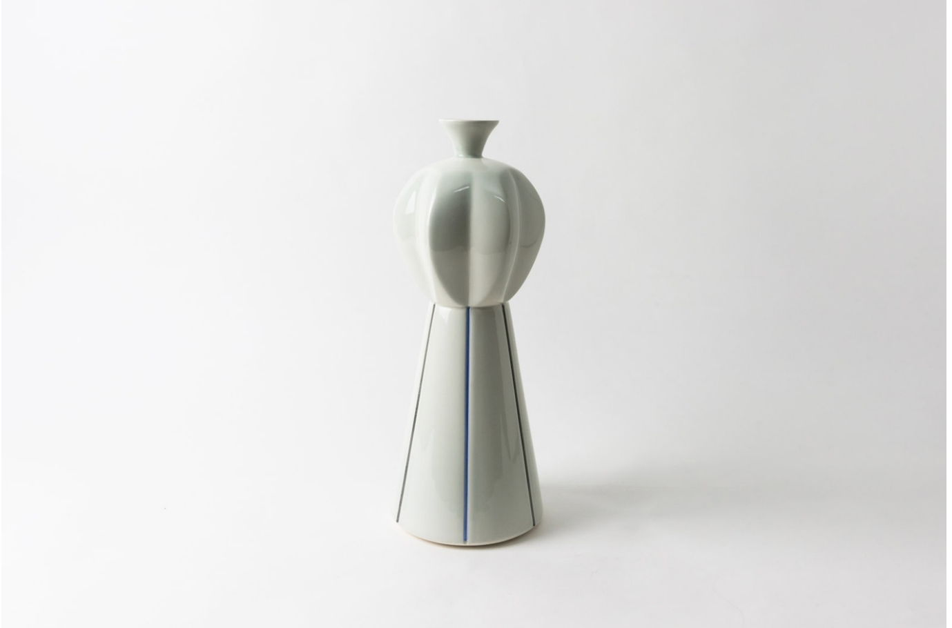
Earthenware, Glass 32 x 13 x 13 cm 12 5/8 x 5 1/8 x 5 1/8 in. (ChR001)