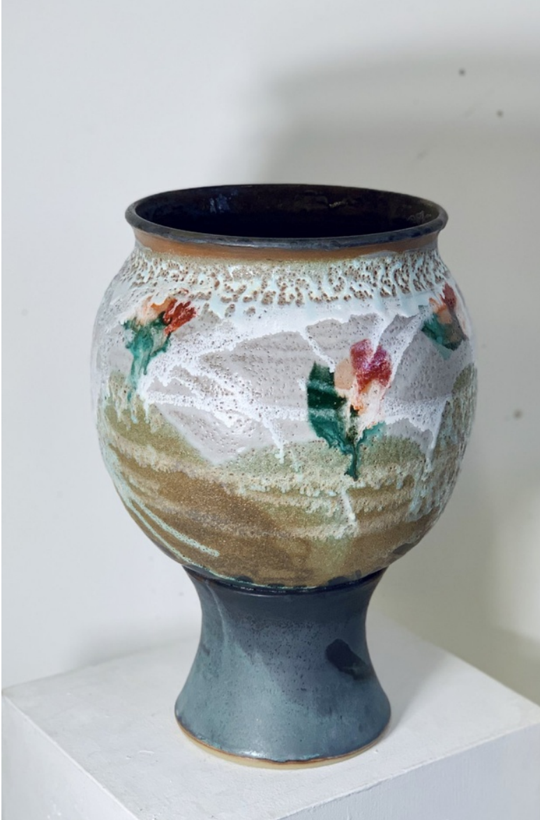
FREYA BRAMBLE-CARTER Spotlight , 2020

Thrown in stoneware by Chris Bramble and glazed by daughter Freya in a compilation of hand made glazes of subtle tones and natural textures. A large planter or lamp stand with a hole on the side for wiring or drainage.