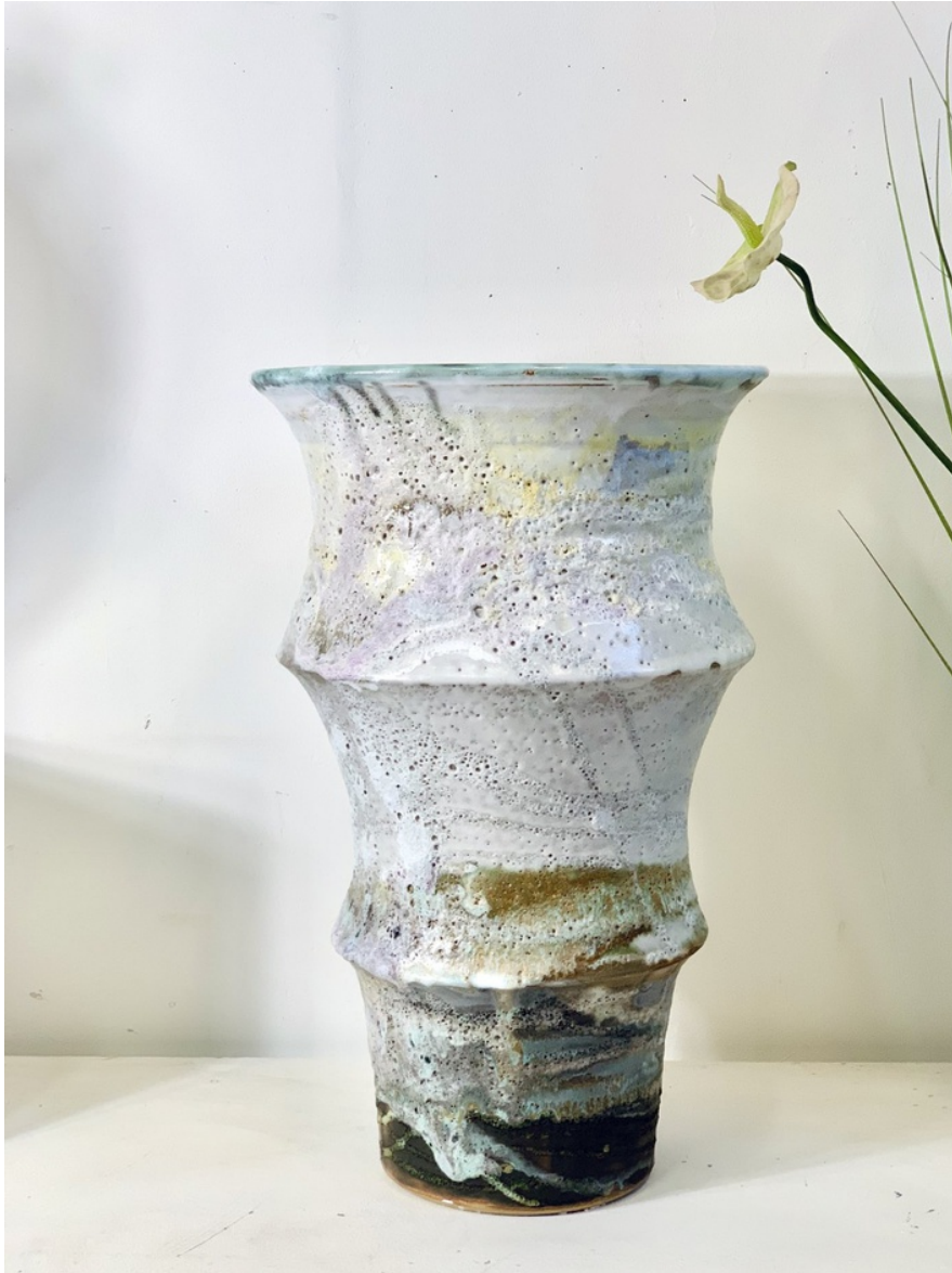
FREYA BRAMBLE-CARTER Fruitful Planter , 2020

Thrown in stoneware by Chris Bramble and glazed by daughter Freya in her favourite joyful combination of glazes, layered with texture and pops of colour.