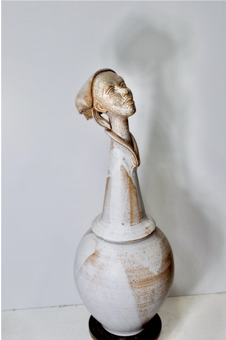
Thrown, Sculpted In Parts And Assembled Stoneware, Glazed In Lucy Rie White. 68 x 25 cm 26 3/4 x 9 7/8 in. (ChBr001)