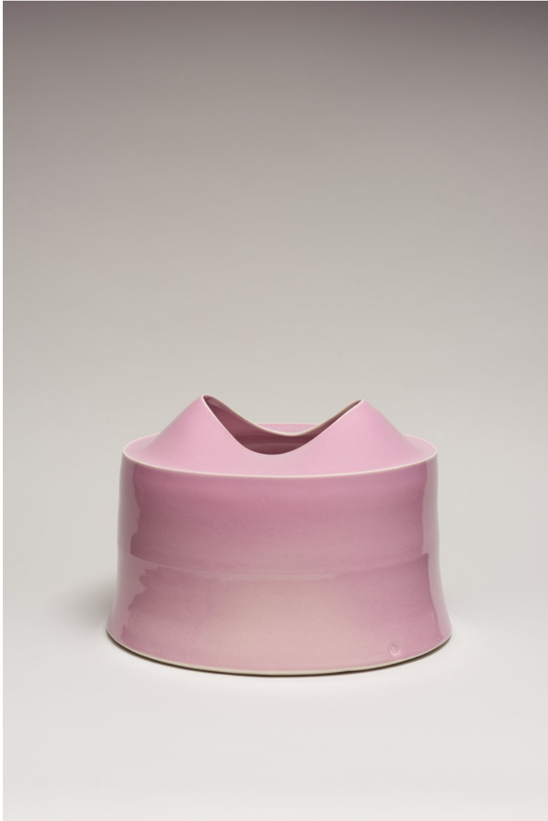
Limoges porcelain, thrown on the wheel, fired 1280° 35 x 24 cm 13 3/4 x 9 1/2 in. (TG001)