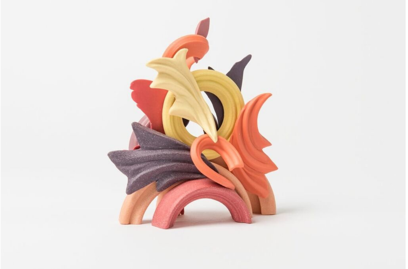
Grogged Porcelain 16 x 14 x 6.5 cm 6 1/4 x 5 1/2 x 2 1/2 in. (JT057)