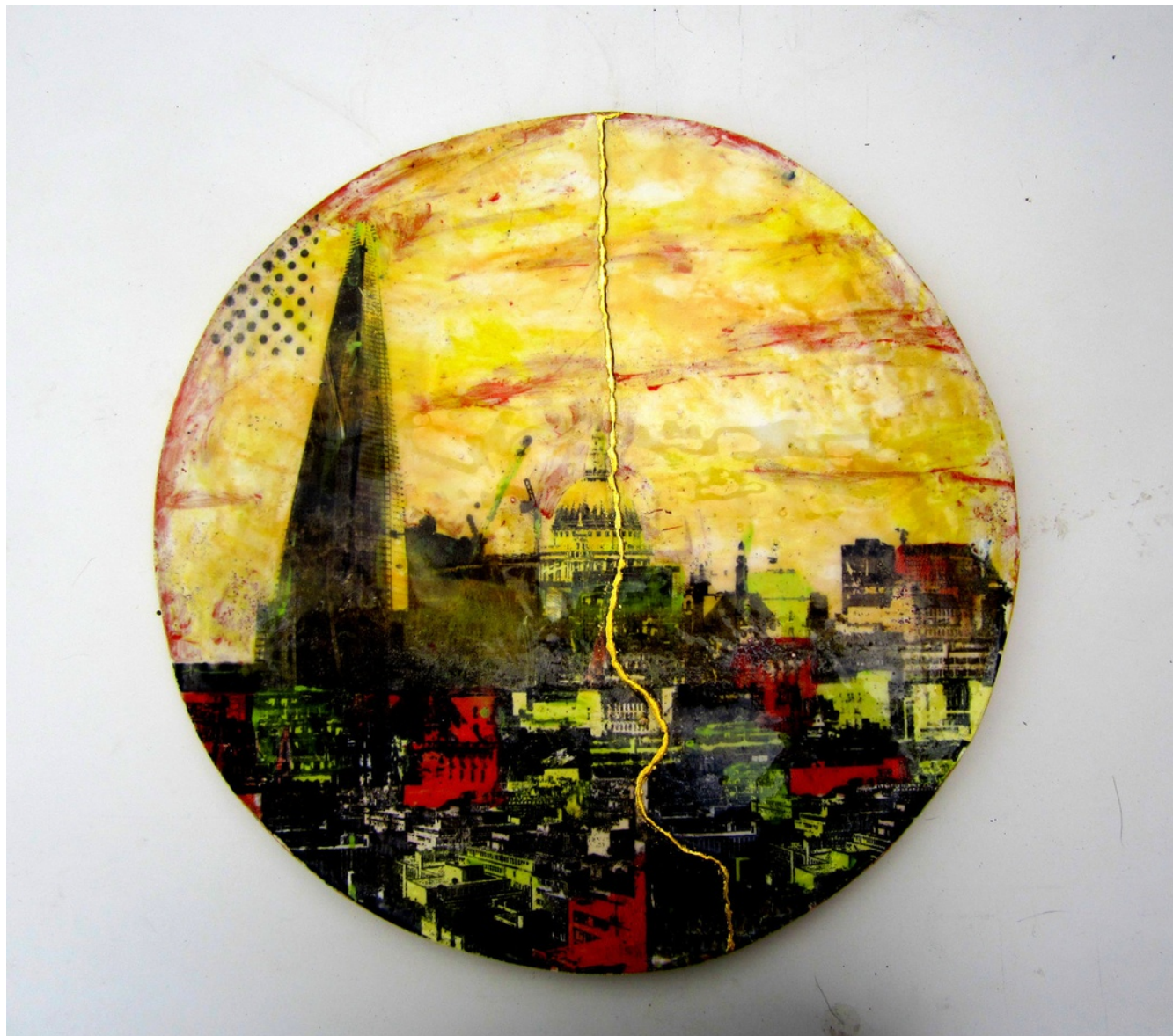
EMMA FINCH City's Gold River , 2016

Grogged white earthenware with 22ct gold. Integral adjustable hanging wire on reverse. Hand printed and painted ceramic platter, depicting London cityscape with Shard and Gold enhancement representing the river Thames. Diameter: 55 cm 21 5/8 in. (EF001)