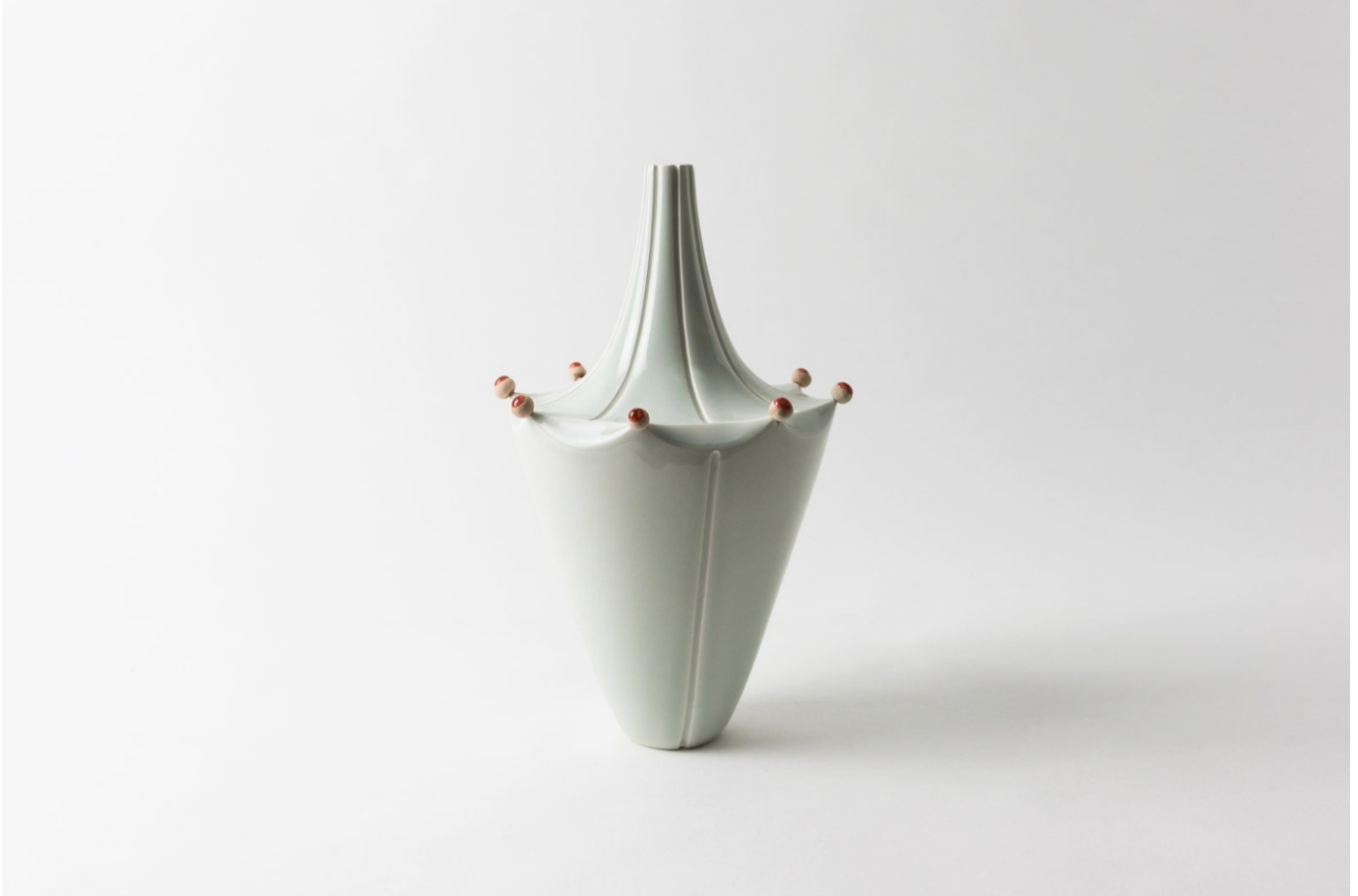
Earthenware, Glass 25 x 14 x 14 cm 9 7/8 x 5 1/2 x 5 1/2 in. (ChR002)