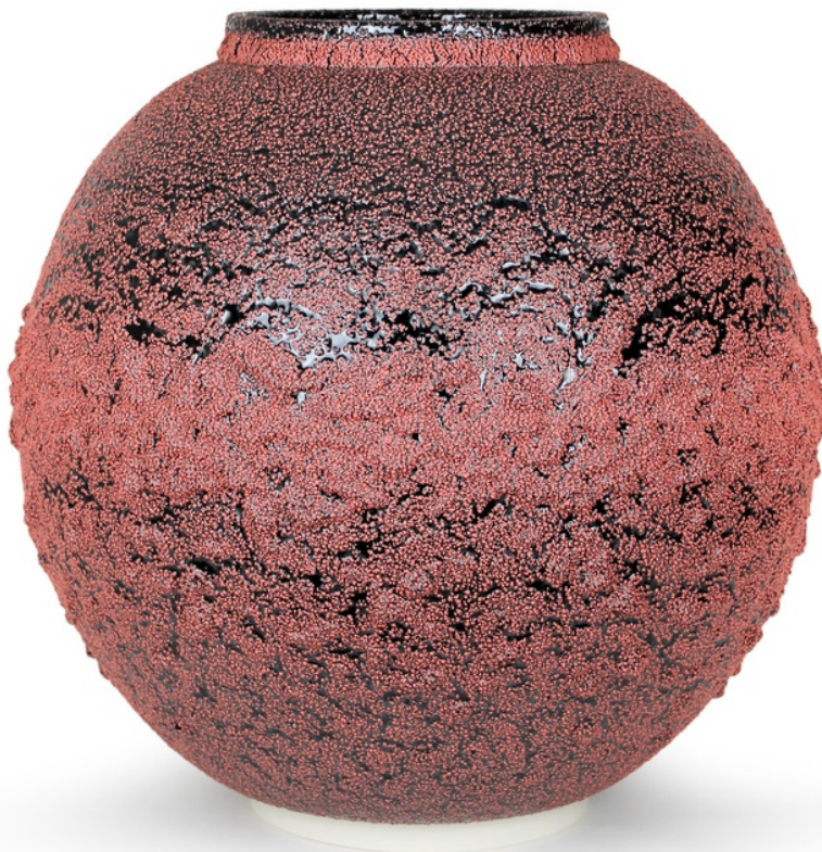
Porcelain; Textured Glazes on Thrown Porcelain 54 x 55 x 55 cm 21 1/4 x 21 5/8 x 21 5/8 in. (AMo020)